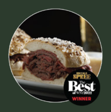
Best Beef on Weck