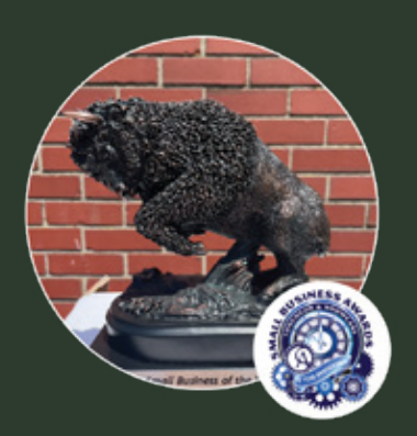
Best Small Business